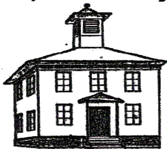
Graded School - 1869 Richford, N.Y.